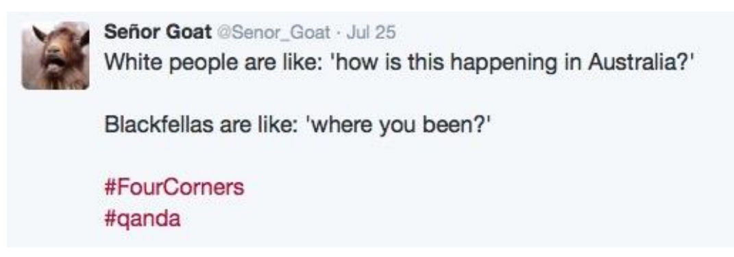
Figure 8: Goat, S. @Senor_Goat, July 25th 2016

This case is an example of collective trauma and not simply an isolated incident of racial vilification based its political and historical precedents. This includes its links to the discourses produced to justify the removal of children. i.e. The Stolen Generations, Indigenous incarceration, and the Aboriginal Deaths in Custody government inquiry and its subsequent report, represent the longstanding colonial tactic of holding Indigenous people accountable for the violent effects of colonialism.