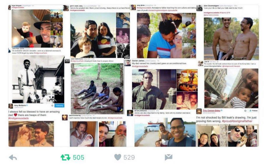
Figure 13: Aboriginal Health, @NACHOAustralia

Aboriginal Health @ @NACCHOAustralia There's something VERY special happening on Twitter tonight .... #IndigenousDads @Matt_Cooke86