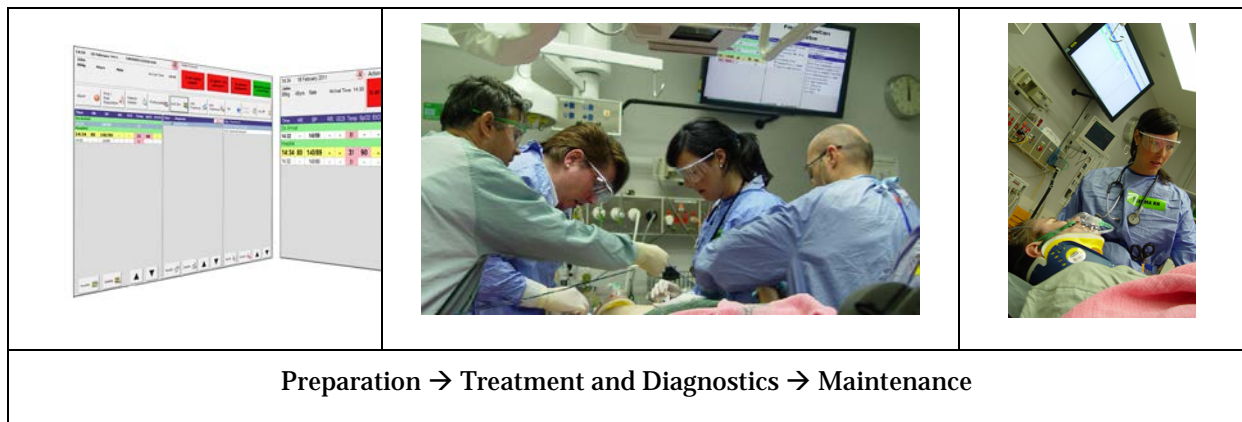
Figure 1: Setting of the Trauma Reception and Resuscitation system 2

significant training required for the SMEs to enrich the system knowledge base, 3) the affordance of a self-sustaining knowledge base available for professionals to employ for review and training purposes, and 4) the medical staff have control over the reference data upon which the medical algorithms depend.