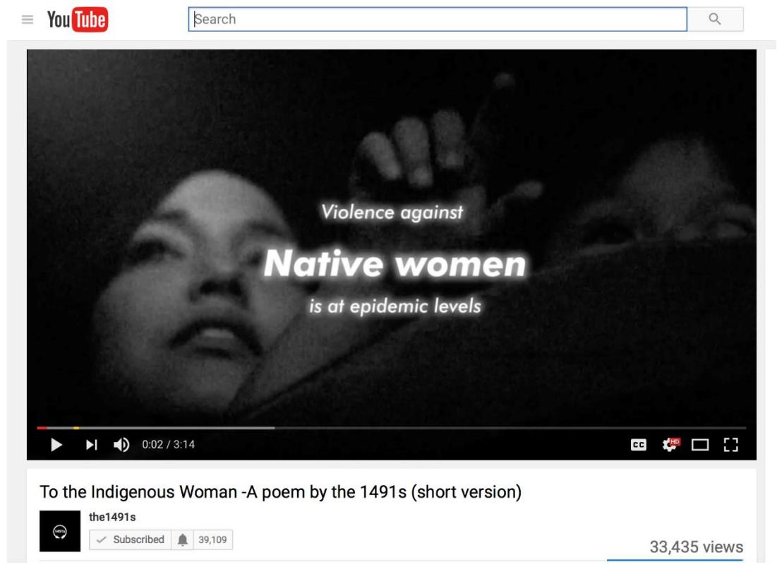
Figure 3: The 1491s, 'To the Indigenous Woman'

Details supplied with the video remind us of shocking, disturbing statistics: